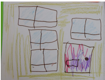
Colour the template page