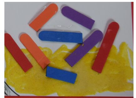
Glue over sandy area, sprinkle on play sand. Shake off excess.

Video craft tutorial available on truesdaykids.com